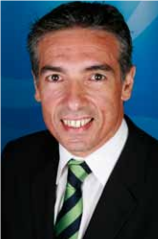
Councillor Angelo Tsirekas Mayor