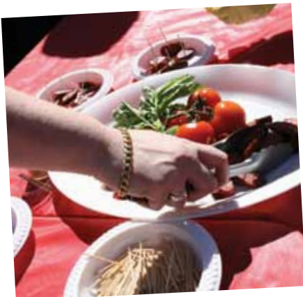
Culinary delights await at FerraKitchen!