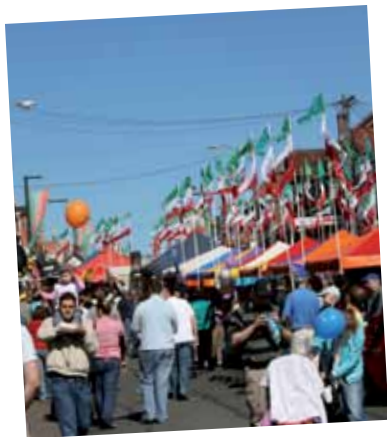
Fantastic market stalls at Ferragosto

Other market stalls will offer everything from lanterns, fashion, jewellery, accessories, arts and craft and musical instruments.