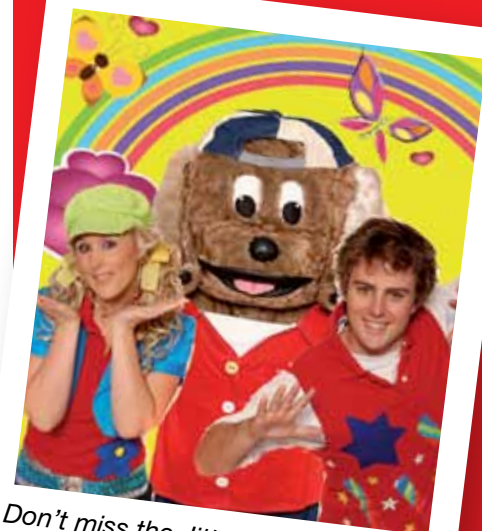
Don't miss the Jitter Jack Puppy Show!

Ferragosto10' will feature a stage in an all new location especially for the kids! FerraKids will have a fantastic range of entertainment including dancing, music, puppet shows, karate demonstrations, rides, roving performers, the giant gingerbread men, plus lots more!