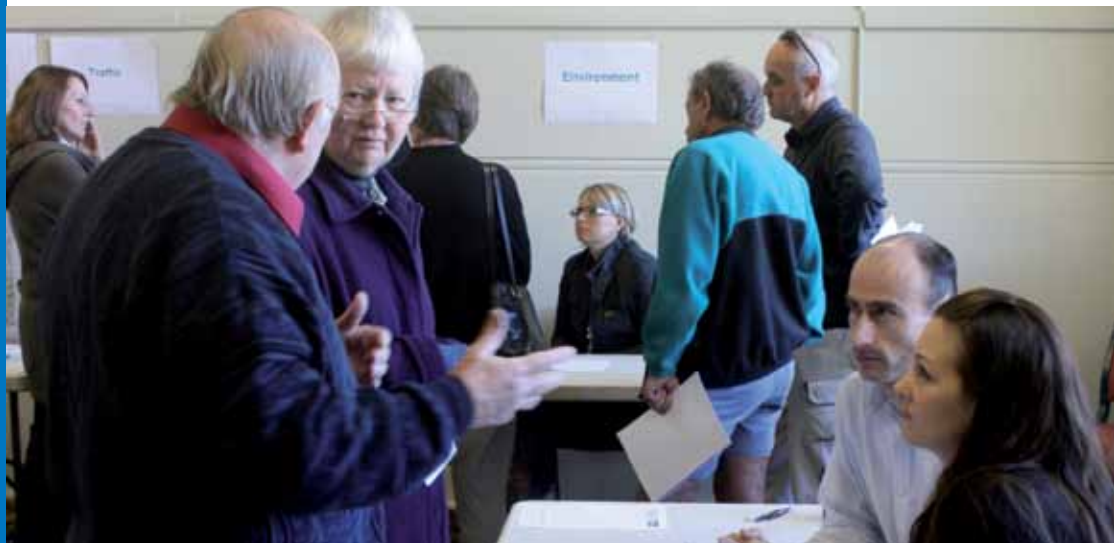
Community members participate in City of Canada Bay community engagement

Our Community Engagement Policy sets out a framework through which community engagement will be considered and delivered. Those affected by decisions have a right to be involved in decision-making and this often achieves better outcomes. However this is not always practical or possible for every decision, so when something has the potential to impact the local community significantly, Council will seek to involve those potentially affected by or with an interest in the decision. Both policies are available on Council's website.