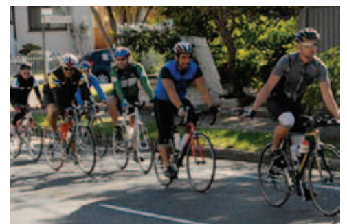
The RIDE 4 Pride team in full flight

in themselves and know that they can overcome adversity. The group wants to thank the community for their support especially Mayor Angelo Tsirekas who encouraged the team along the way.