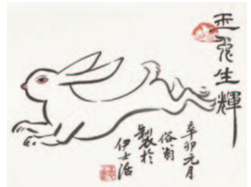
Calligraphy and Chinese brush painting is in focus during June at Concord Library.

Council's website through the Your Local Library pages.