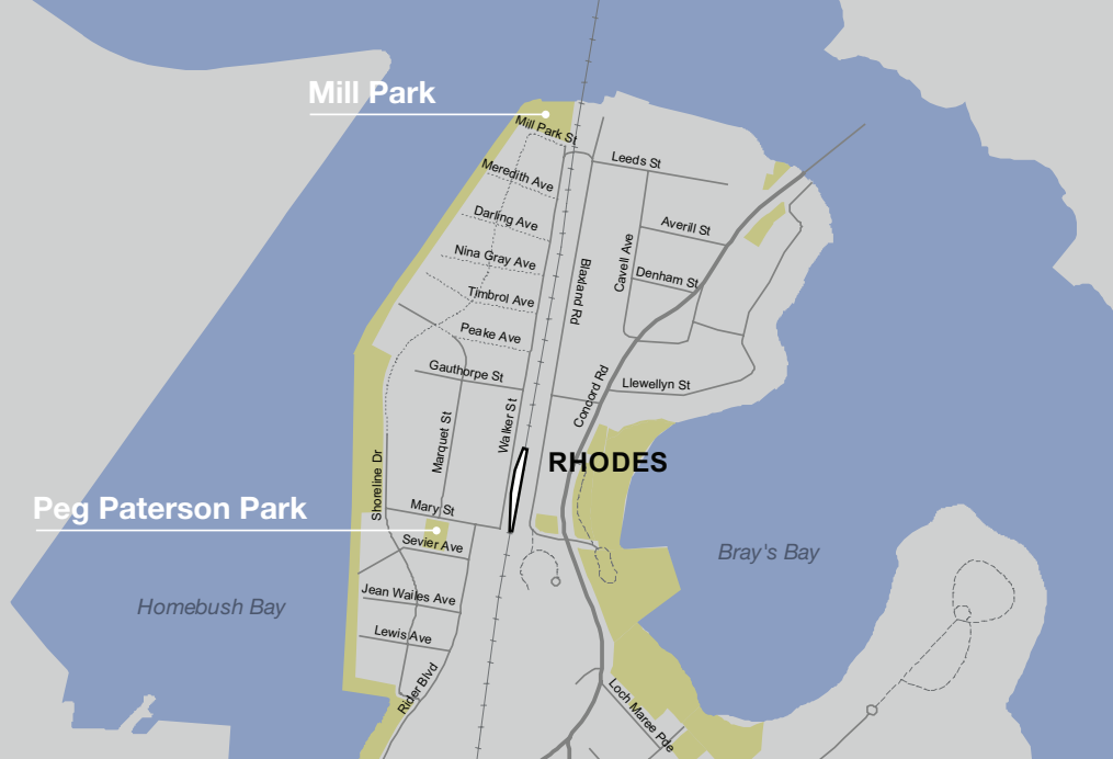
Locations of Mill Park and Peg Paterson Park, Rhodes