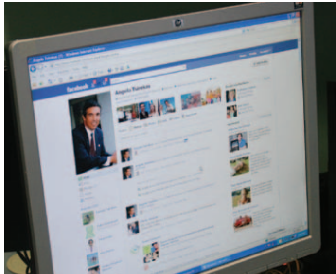
The Mayor's Facebook page

You can keep up with the latest news from the mayor's desk with Bayside e-Brief. This