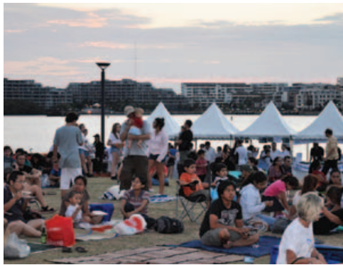
Rhodes Waterside Park was the ideal location for Cinema in the park recently

Rhodes Waterside Park was the venue for Cinema in the Park, when Communities for Communities hosted The Lion King.