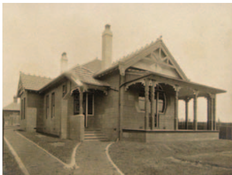
Verandahs are important in establishing the character of a house

Further information can be found on Council's website on www.canadabay.nsw.gov.au or contact Council's Strategic Planning team on 9911 6403.