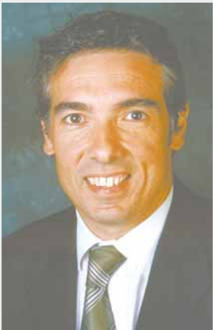
Mayor Angelo Tsirekas