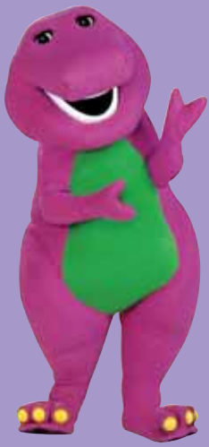
2004 Lyons Partnership, L.P. All rights reserved.