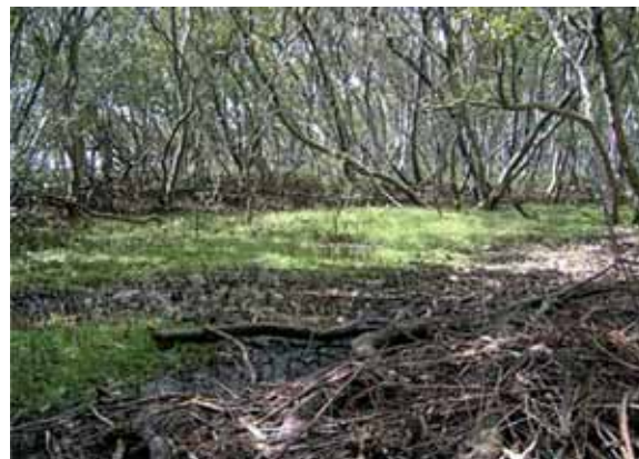
Swampland Forest with River She-oaks

Nestlé Rhodes is taking part in this important conservation project through the Nestlé Community Environment Program, which works to improve the environment in communities across Australia where Nestlé operates.