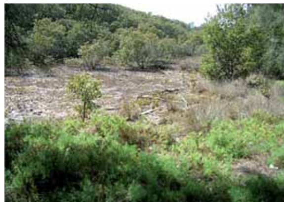
River Mangroves/Mudflats/Coastal Saltmarsh interface