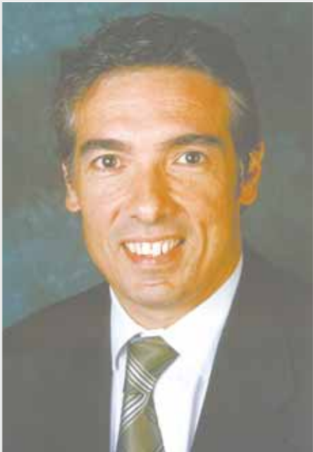
Mayor Angelo Tsirekas

City of Canada Bay Council Newsletter NOVEMBER 2005 ISSUE 32