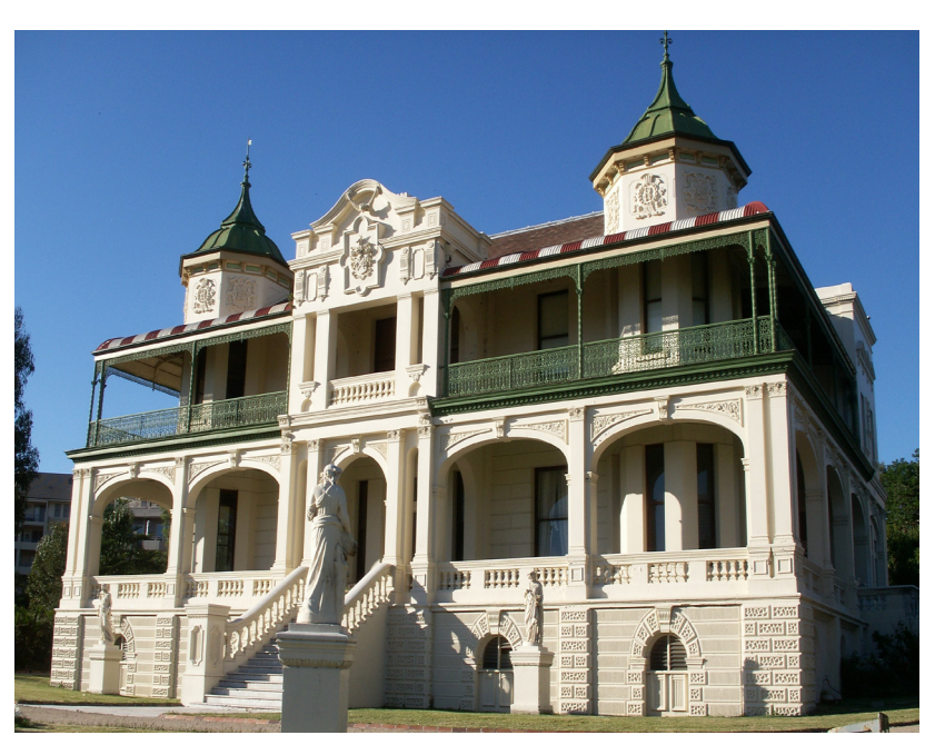
Abbotsford House, 2005

Abbotsford House was one of Sydney's grandest Victorian mansions. A symmetrical design distinguished by two impressive towers on each front corner and a grand entry porch above imposing front steps. The outstanding, spired cupolas atop the twin towers and the elaborate decoration anticipates what became known as the Boom Style in the 1880s.