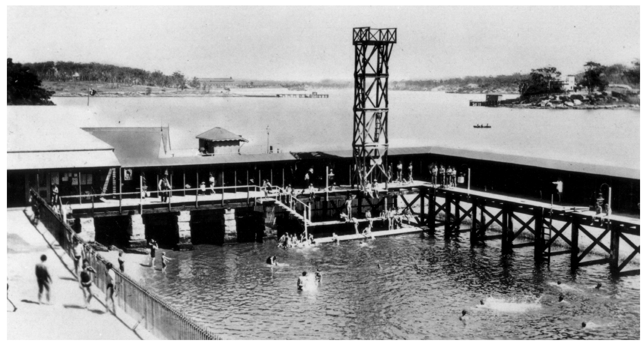
Abbotsford Bath circa 1920.