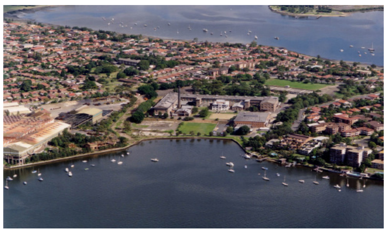
Aerial view of the former Nestle factory with Abbotsford House, June 1989