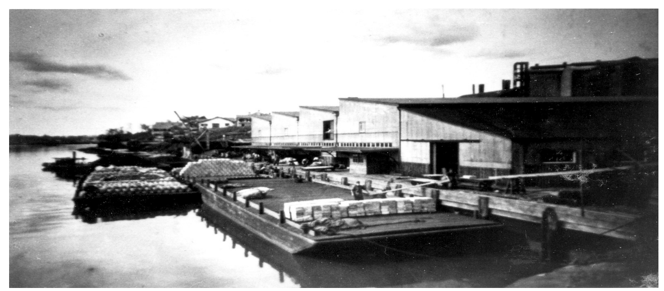
Lysaght Bros Wharf, 1930s