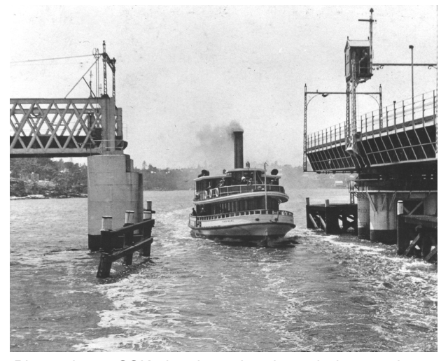
Photo above: SSKaringal passing through the opening span of the old Gladesville Bridge, 1940s

The original Gladesville Bridge opened in 1881 It was built in five spans with iron pylons and included a swing span which pivoted on a central pylon, giving two channels, each 20 m in width, for shipping to pass through. The structure was designed to be strong enough to carry light rail, and by 1910, the tramline had been extended from Drummoyne to Ryde.