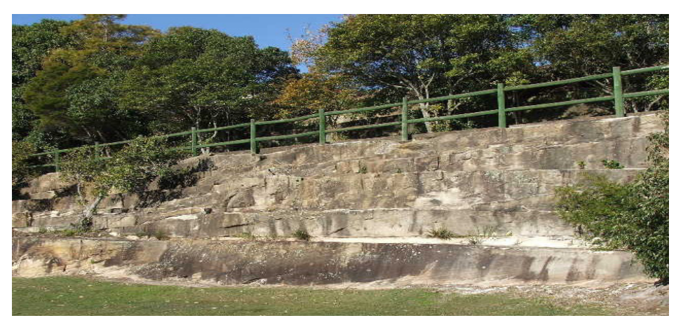
Battersea Park and Sea Wall, 2007

A magnificent late Federation style house, circa 1915 with high pitched complex, slate roof with terra cotta ridge capping, roughcast gable and shingled window hoods. An unusual feature of special note is the glass extension with outstanding etched pattern, which