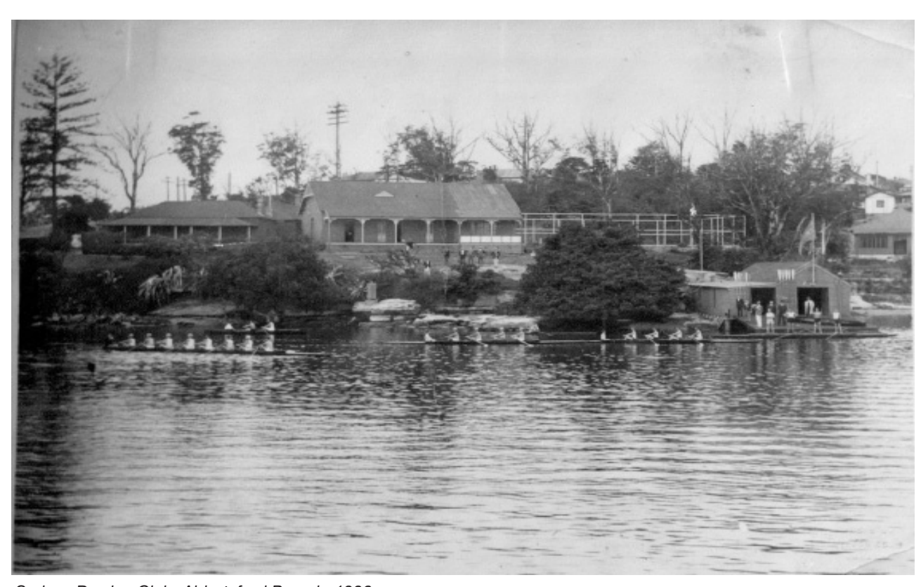
Sydney Rowing Club, Abbotsford Branch, 1926

The finishing line of a 2000m rowing course on the River and for the Head of the River races is marked from Sydney Rowing Club (photo below).