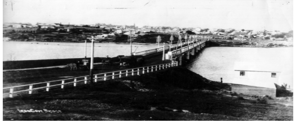
Iron Cove Bridge

A small strip of natural foreshore that has survived road works and other development remains at Sisters Bay. It is one of the few places in Drummoyne where the original natural foreshore is publicly accessible. Rock edges, sandflats and mangroves such as those found here were once common in the Drummoyne area.