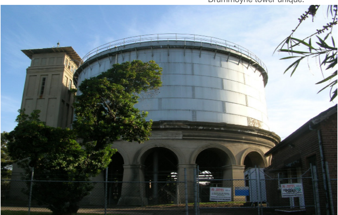
Drummoyne Reservoir, 2009

The elevated reservoir was built in 1910 by the then Metropolitan Board of Water Supply and Sewerage. At the insistence of Thomas Henley, the concrete tower was added in 1912. The tower copied a similar one at Bellevue Hill that had been built as a lookout for military purposes. The Bellevue Hill tower was demolished, making the Drummoyne tower unique.