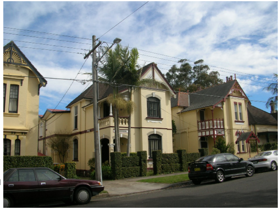
The Laurels, Glendenning and Wyncroft, 53-57 Thopmpson Street, 2009

Bourke Square was to be the centrepiece of Bourketown. A statue of Governor Bourke was planned for the square but was never erected. 1841 reports suggest it was delayed by problems with finding good quality stone, but there are no known reports that the statue was ever erected.