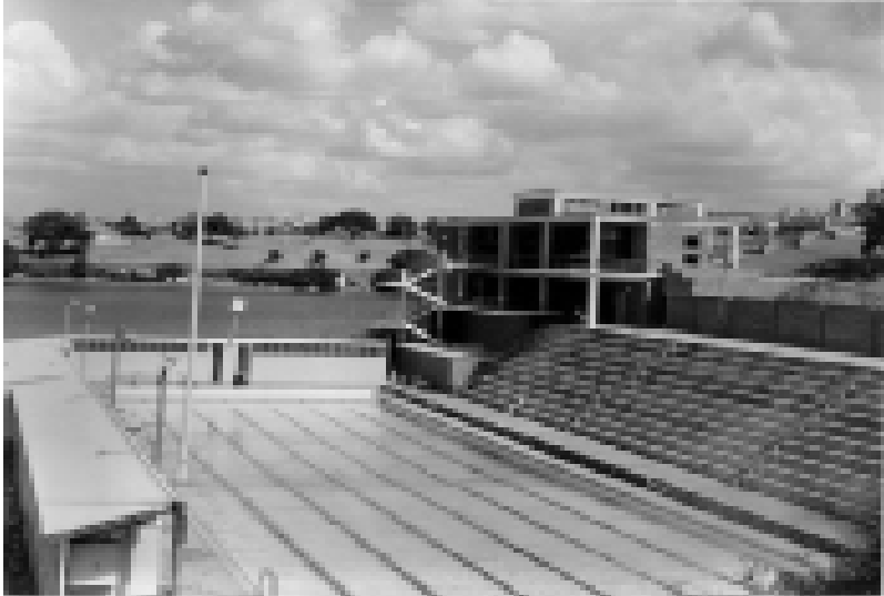
Drummoyne Swimming Pool, 1961