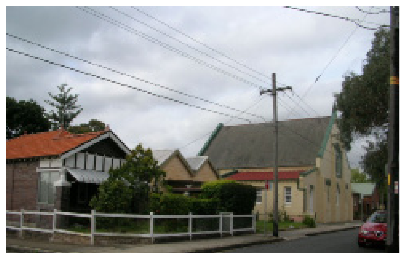
Drummoyne Baptist Church, Bowman Street, 2005