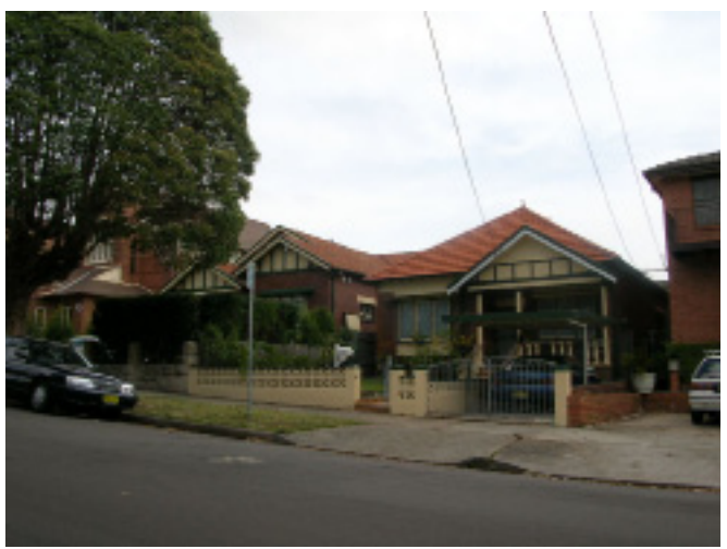
35 and 37 College Street, 2007

The first Anglican church on this site was a timber building constructed in 1884. It was moved to the rear of the site to make way for a brick church completed in 1901. A rectory was built in 1910.