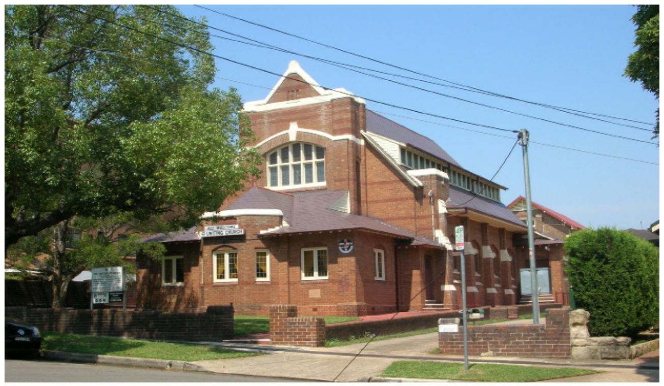
Drummoyne Uniting Church, 2007

Prominent architect Emil Soderstein designed the new church and the building was complete in 1931. The rose window at St Bede's was designed and made by Alfred Handel.