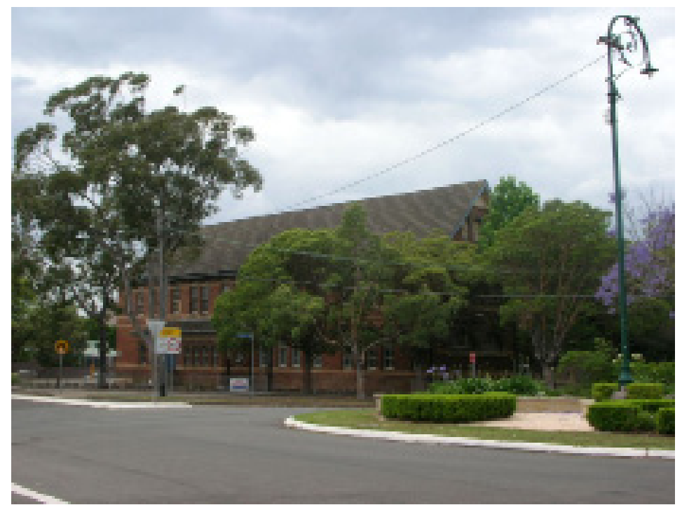
Drummoyne Public School with Bourketown Square, 2005

Land for Drummoyne Public School was acquired in 1886. The original, temporary wooden building, was replaced in November 1897 by a brick building to house 170 students. Additions to accommodated girls were completed in 1900. The first school assembly hall in NSW was built here in 1911, although the building has been altered. A second storey addition was made in 1915. The school grounds retain a number of mature trees believed to date from the 1920s, including Canary Island Palms, Cypress Pine, Hoop Pine and ornamental olive trees.