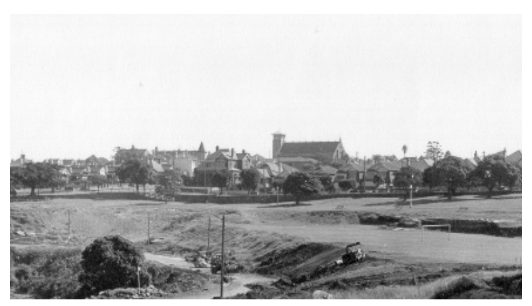
Henley Marine Drive, 1959.