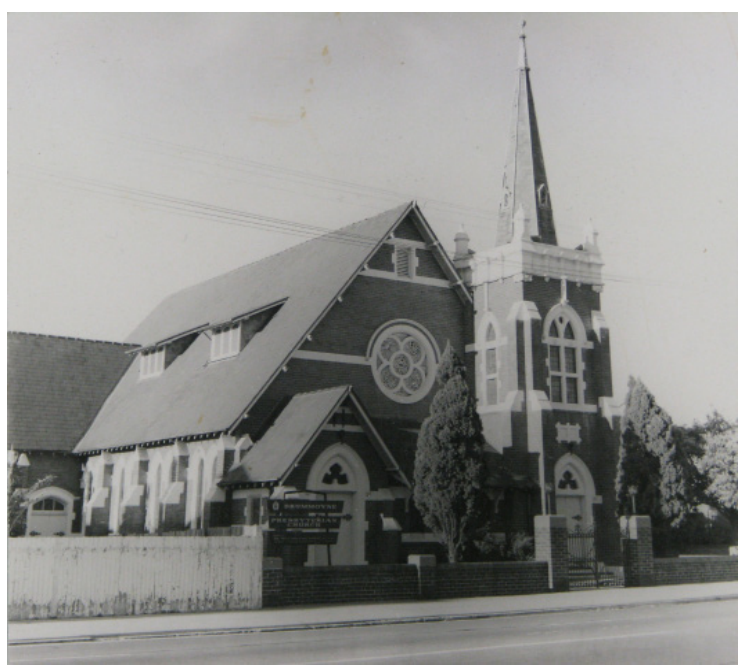
Drummoyne Presbyterian Church, 1970

The Drummoyne Fire Station was eretced in 1896. It is a good example of a Federation arts and crafts style fire station, probably designed by the Government Architect Walter Liberty Vernon. The style was quite common at the time and Drummoyne's example is notable for its integrity.