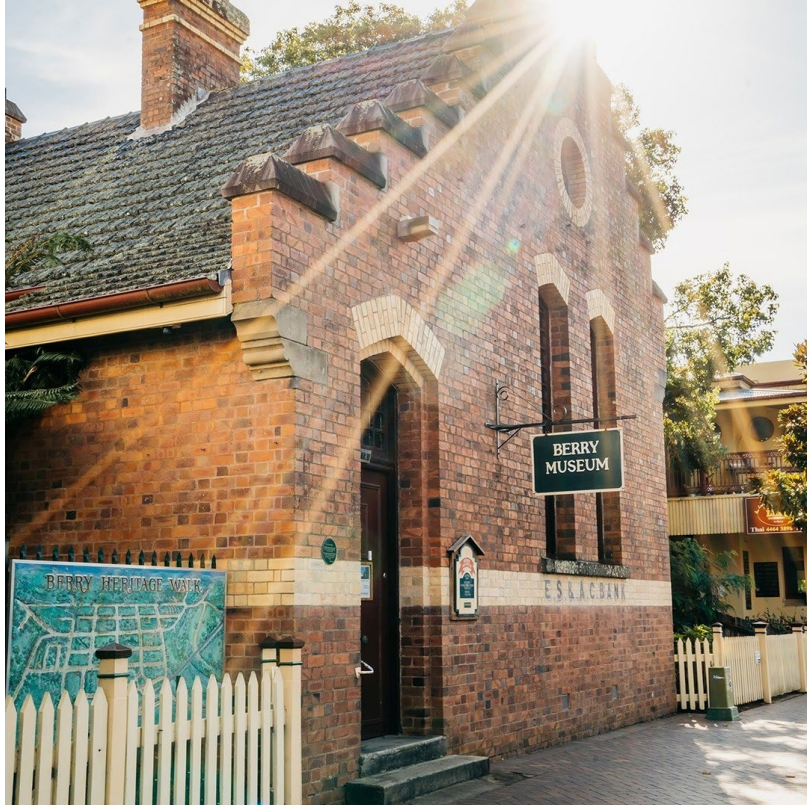
Berry Museum.

On this great trip, you'll be taken on a journey along the picturesque Grand Pacific Drive, the Sea Cliff Bridge and down to the historic town of Berry.