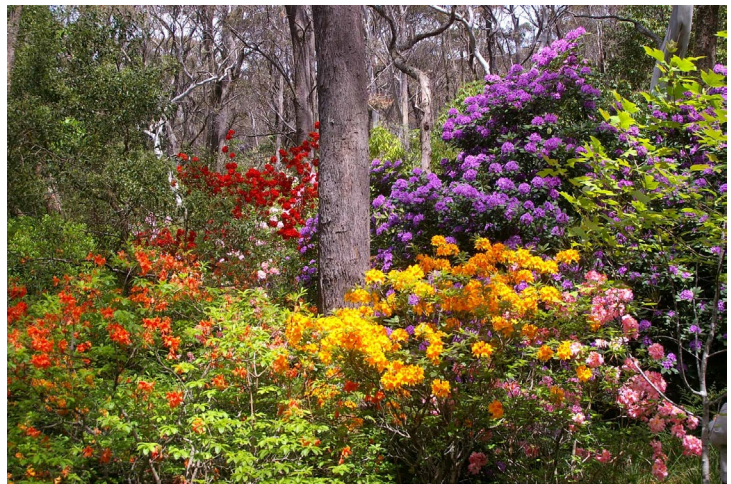
Campbell Rhododendron Gardens (Photo by Blue Mountains Rhododendron Society of NSW).

The garden has a series of nature walks leading to the valley floor and the lake, with limited disabled access – most of the paths from the Lodge are bitumen, the rest are in a natural state and have a varying number of steps. The Lodge will be open for refreshments and specialises in Devonshire tea!