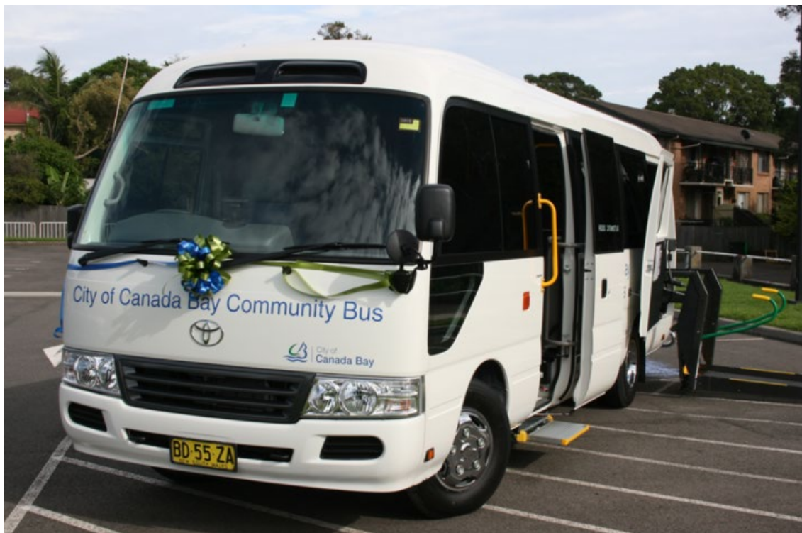
Our community bus.