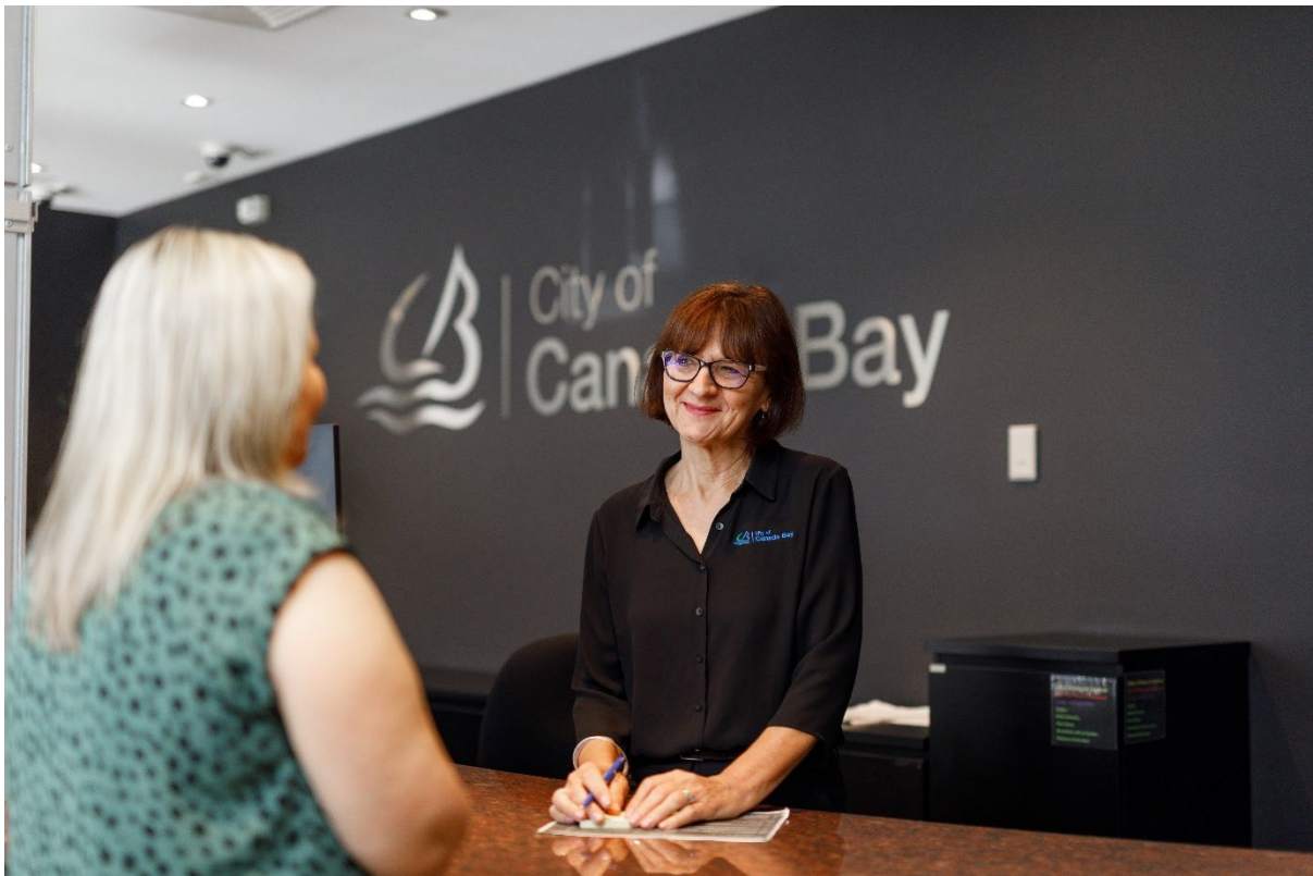
Our Customer Service Desk at the Civic Centre, Drummoyne.

If you have questions regarding the Active Adults bus trips, please contact Community Services Administration on 9121 0005.