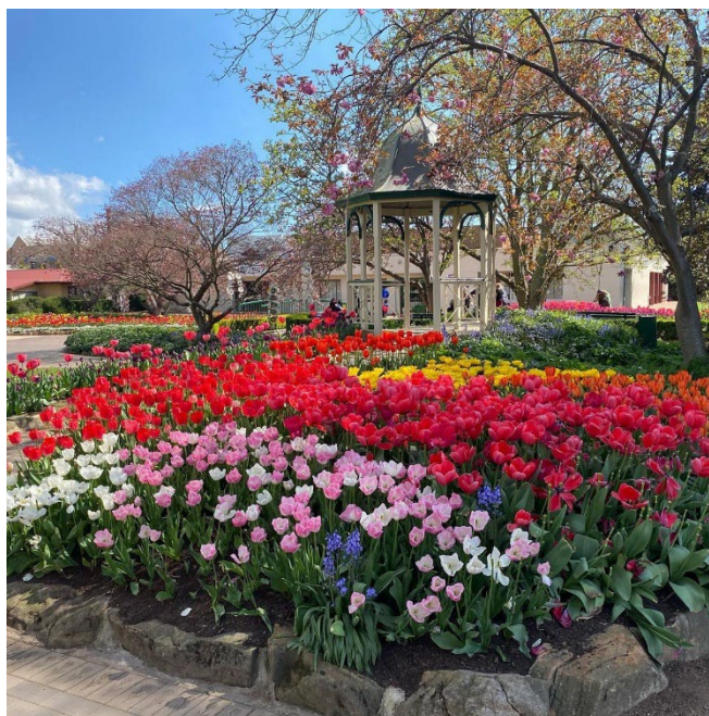
Tulip Time Festival in Bowral (Photo by Ellie Warner).

You may choose from any of the lunch spots in Bowral, before meeting back at the bus at the designated time and location for the return journey.