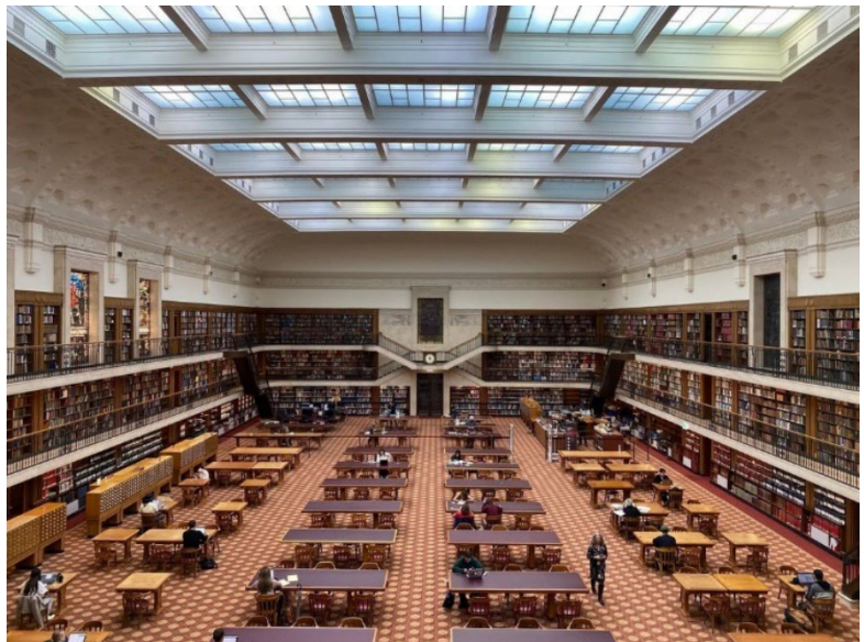
Mitchell Library (Photo by State Library of NSW).

In October 2018 the State Library also opened new, refurbished galleries. Over 3,000 intriguing objects went on display to the public for the very first time so there are many stunning exhibitions that stretch across the first floor of the Mitchell building in the new Michael Crouch Family Galleries and the Dixson Galleries.