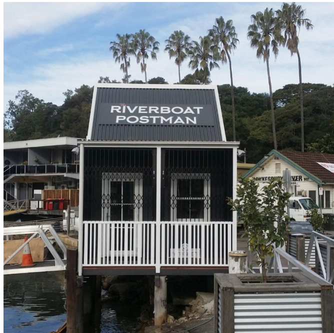
The riverboat ticket office (Photo by @theriverboatpostman).

On this outing you'll cruise on the Hawkesbury Mail Boat (the Riverboat Postman), enjoying the magnificent scenery of the lower Hawkesbury River as they deliver the mail and other essentials to the river-access-only settlements upriver from Brooklyn. All of the skippers are locals, who can entertain you with stories of the river as you cruise up this spectacular waterway. They deliver to the settlements of Dangar and Milson Islands, Kangaroo Point, Bar Point, Marlow Creek, Fisherman's Point and Milson's Passage.