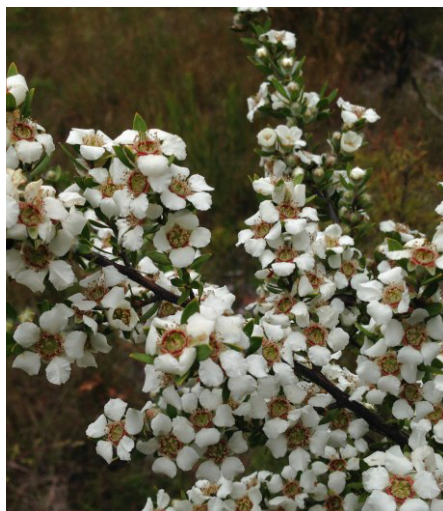
Leptospermum trinervium Paperbark Tea-tree (diversitynativeseds.com.au)