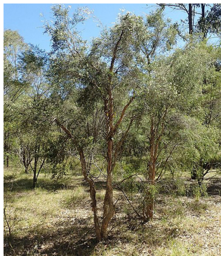
Melaleuca nodosa Ball Honey Myrtle (Booral -)