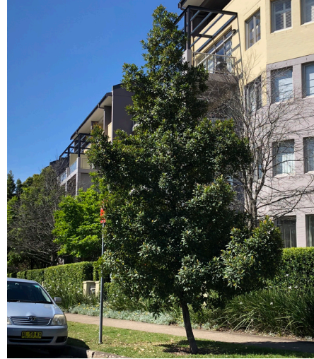
Elaeocarpus reticulatus Blueberry Ash (G. Sicari CCBC)