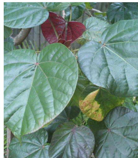
Hibiscus tiliaceus var rubra Purple leaf Hibiscus (image source)