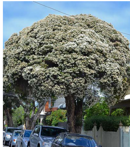
Melaleuca linariifolia Snow in Summer