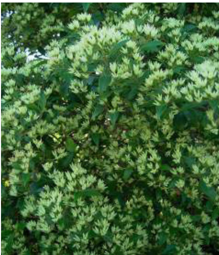
Backhousia myrtifolia Grey Myrtle