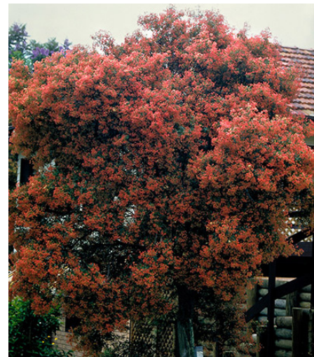
Ceratopetalum gummiferum NSW Christmas Bush (anpsa.org.au)