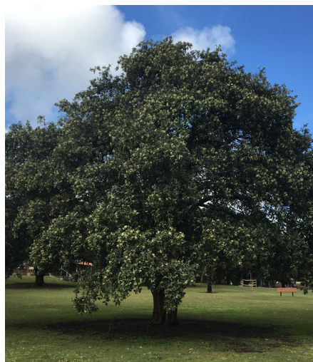
Syncarpia glomulifera Turpentine (Robson Park, Haberfield -)