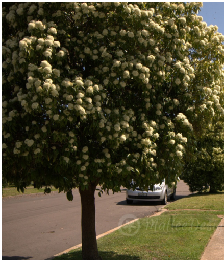
Backhousia citriodora Lemon-scented Myrtle (malleedesign.com.au)