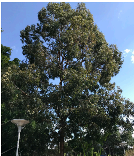
Eucalyptus paniculata Grey Ironbark (Leichhardt - W. Wright CCBC)