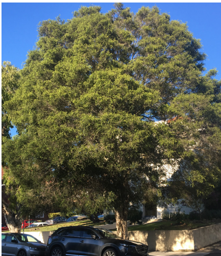
Melaleuca styphelioides Prickly Paperbark (W. Wright CCBC )