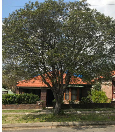
Tristaniopsis laurina 'Luscious' Water Gum - Luscious (W. Wright CCBC)