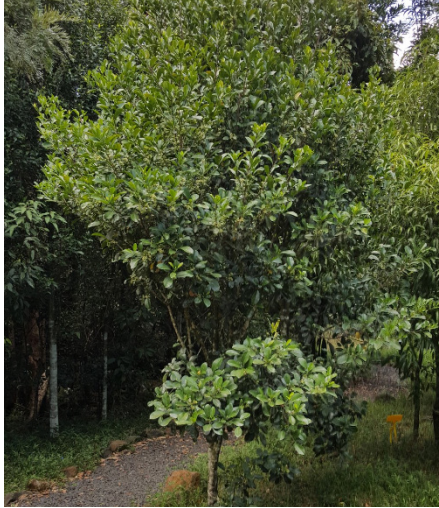
Acronychia laevis Hard Aspen (Lismore Rainforest Botanic Garden -)