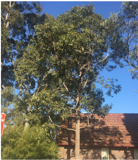
Corymbia gummifera Red Bloodwood (Dalhousie St, Haberfield - W. Wright CCBC)