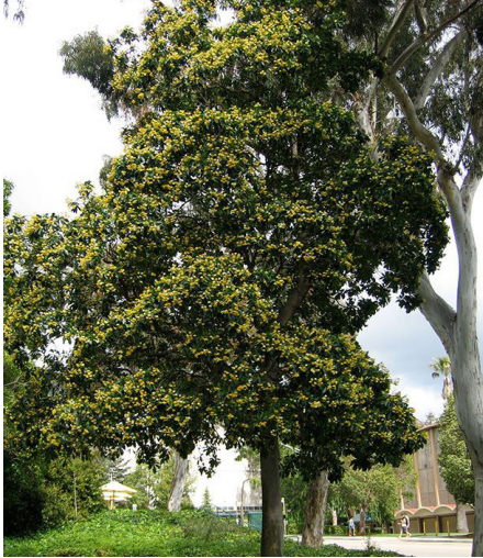
Hymenosporum flavum Native Frangipani