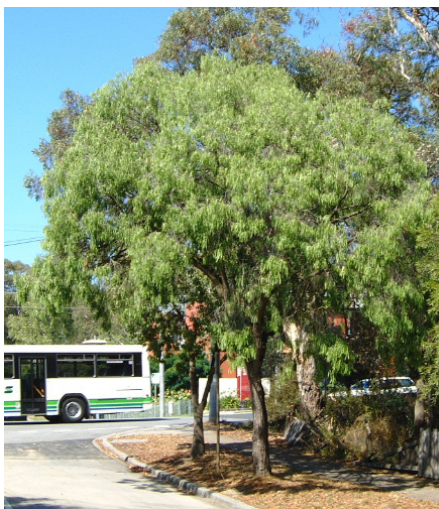
Geijera parviflora Wilga - Australian Willow