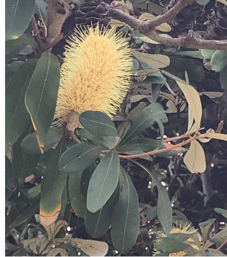
Banksia integrifolia Coastal Banksia (W. Wright CCBC)