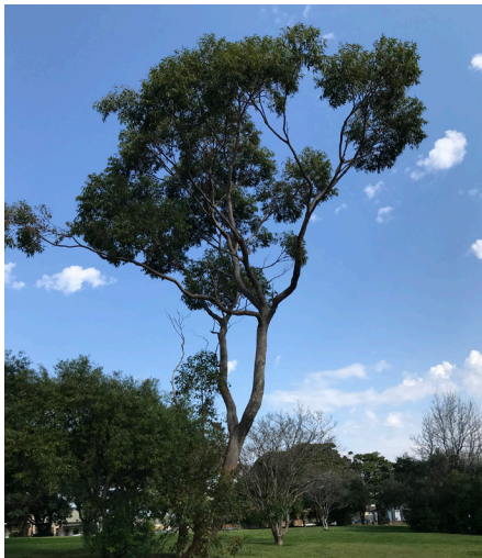
Eucalyptus botryoides Bangalay (Callan Park, Lilyfield - W. Wright CCBC)