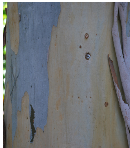
Eucalyptus punctata Grey Gum (W. Wright CCBC)