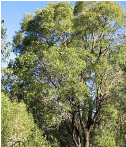
Angophora bakeri Narrow Leaf Apple (Sutherland Council Native Plant Selector)