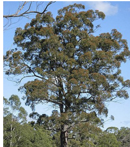
Eucalyptus globoidea White Stringybark (Jackie Miles)