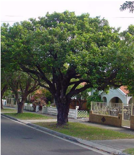
Glochidion ferdinandi Cheese Tree (Randwick City Council)