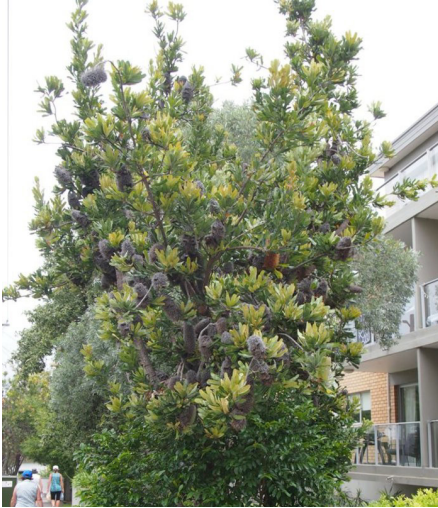
Banksia serrata Old Man Banksia (plantpedia.com.au)