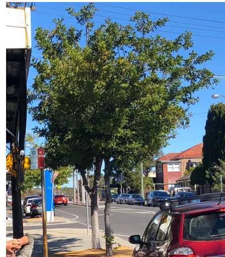
Cupaniopsis anacardioides Tuckeroo