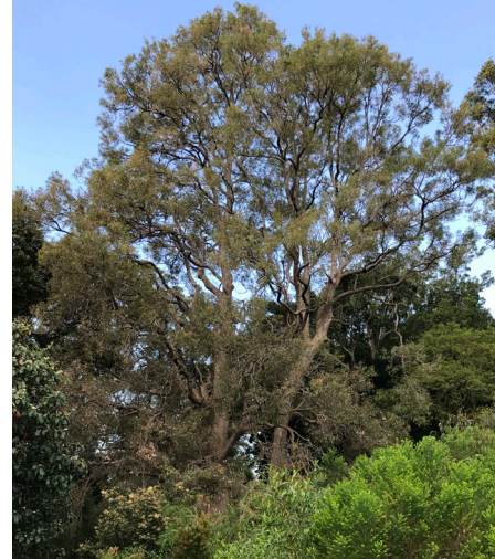
Angophora floribunda Rough Bark Apple (Callan Park, Lilyfield -)