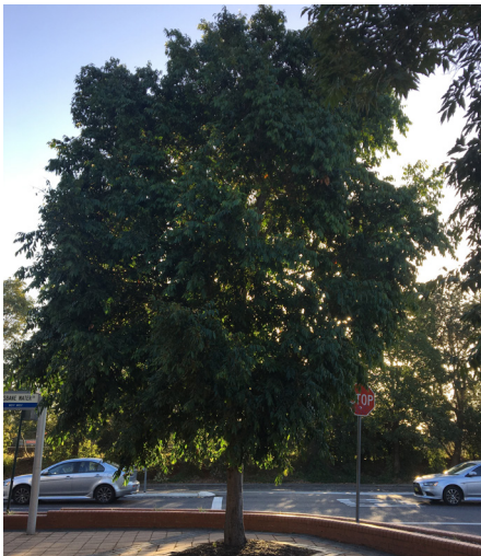
Waterhousia floribunda Weeping Lilly Pilly