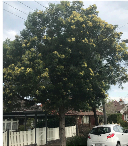
Acacia parramattensis Sydney Green Wattle