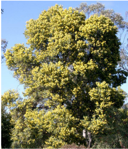
Acacia binervia Coastal Myall (Burrendong Botanic Garden Alice Newton)