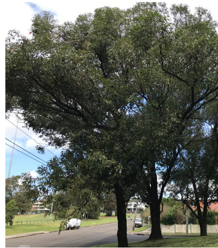
Eucalyptus robusta Swamp Mahogany (W. Wright CCBC)