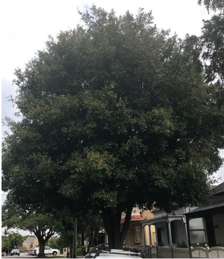
Acmena smithii Lilly Pilly (Lilyfield -)