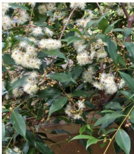
Syzygium oleosum Blue Cherry Lilly Pilly