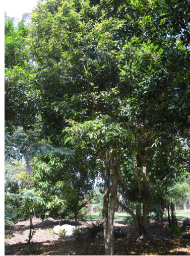
Alectryon subcinereus Native Quince