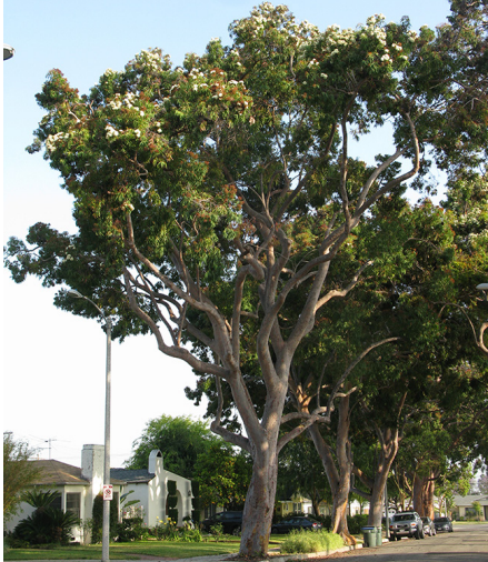
Angophora costata Sydney Red Gum