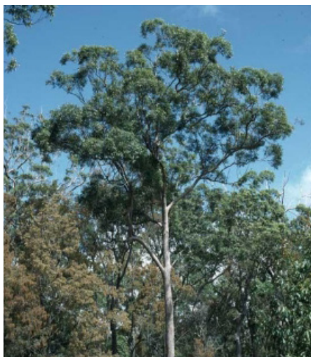
Eucalyptus resinifera Red Mahogany (Brooker & Kleinig)