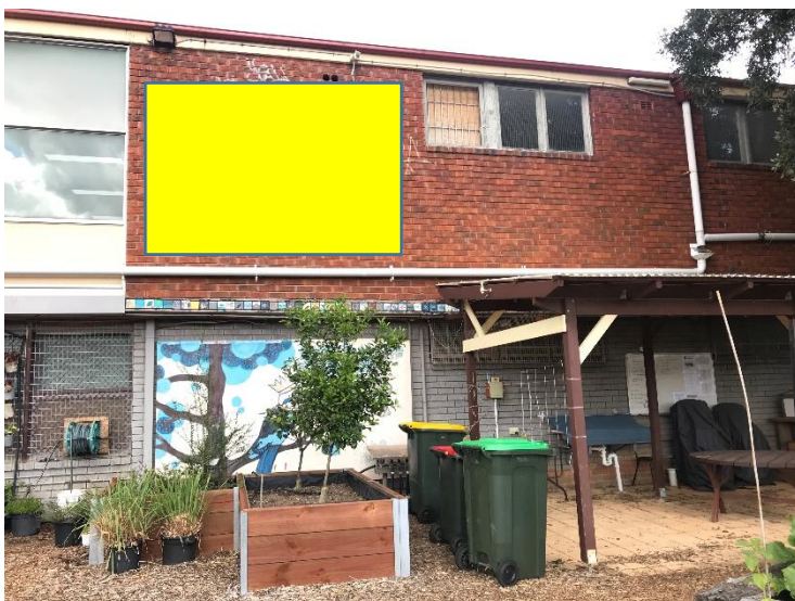
Photo 3, 4: Artwork to be located in the area shown in yellow above

Wall dimensions: Height 2.8 metres X Width 3.7metres. (approx.)