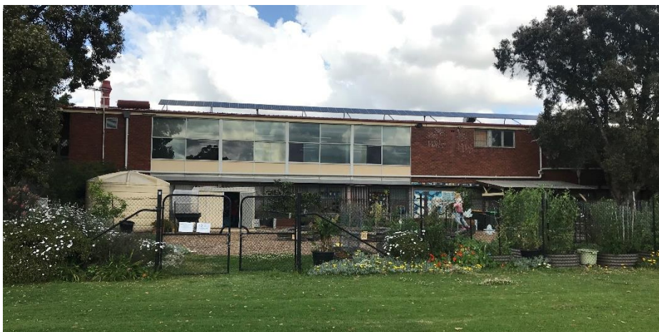
Photo 2: Concord Community Garden (behind the Concord Community Centre)

The vision is for a public artwork to be installed on the wall at the back of the Concord Community Centre, 1a Gipps Street, Concord. This artwork aims to clearly name the “Concord Community Garden” so it can be easily visible to the community and visitors to the garden. The artwork should resonate with the community and the physical space within the garden, reflecting the purpose of a community garden as a welcoming community space for sharing, learning and gardening by all members of the community.