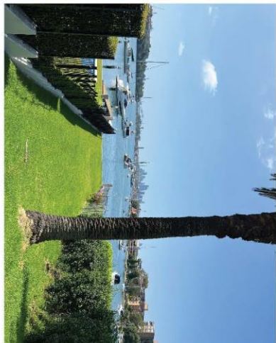
Current site conditions - Lower level (A2)