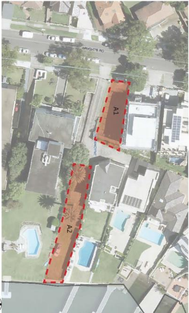
Utz Reserve - Location map