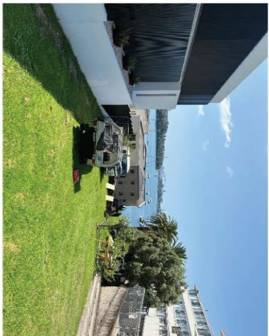
Current site conditions - Upper level (A1)