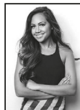
JESSICA MAUBOY Indigenous Recording Artist

Name: _____ Age: _____ School: _____ Years: _____