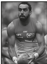
ADAM GOODES Indigenous AFL Player & Australian of the Year