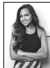
JESSICA MAUBOY Indigenous Recording Artist

Name: _____ Age: _____ School: _____ Years: _____