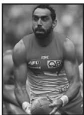
ADAM GOODES Indigenous AFL Player & Australian of the Year